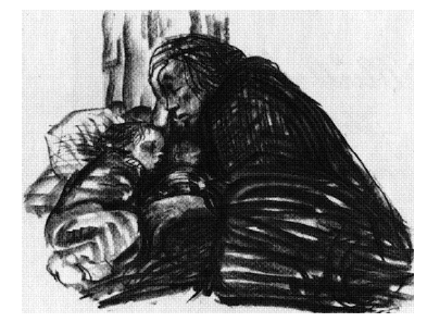
City Shelter, Kathe Kollwitz, 1926, public domain

The observances of Tish'a B'Av-not wearing fresh clothes, not washing, fasting from eating and drinking and sexual contact, not greeting each other, not sitting anywhere except on the ground-are closer to the experience of being a refugee than to being a mourner. The destruction of the Temple stands not just for the destruction of Jerusalem, but for the city being turned into a war zone, with all that entails: people becoming prey to hunger, violence, and death. Tish'a B'Av is not primarily about the Temple - Chaza"l, the rabbis, figured out how to live without the Temple long ago. Rather, Tish'a B'Av is about homelessness, fleeing from war into famine, being thrown into a hostile world without shelter or protection - things all too present in our world. It's an opportunity empathize, to confront the ways we abuse our power, as individuals, as a society, as a people, and as a species, turning other people and other species into refugees.